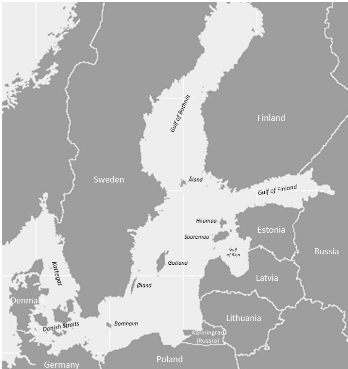
Figure 2. The Baltic Sea

reaching heights of 12 metres or more. There are no significant tidal impacts, but strong winds